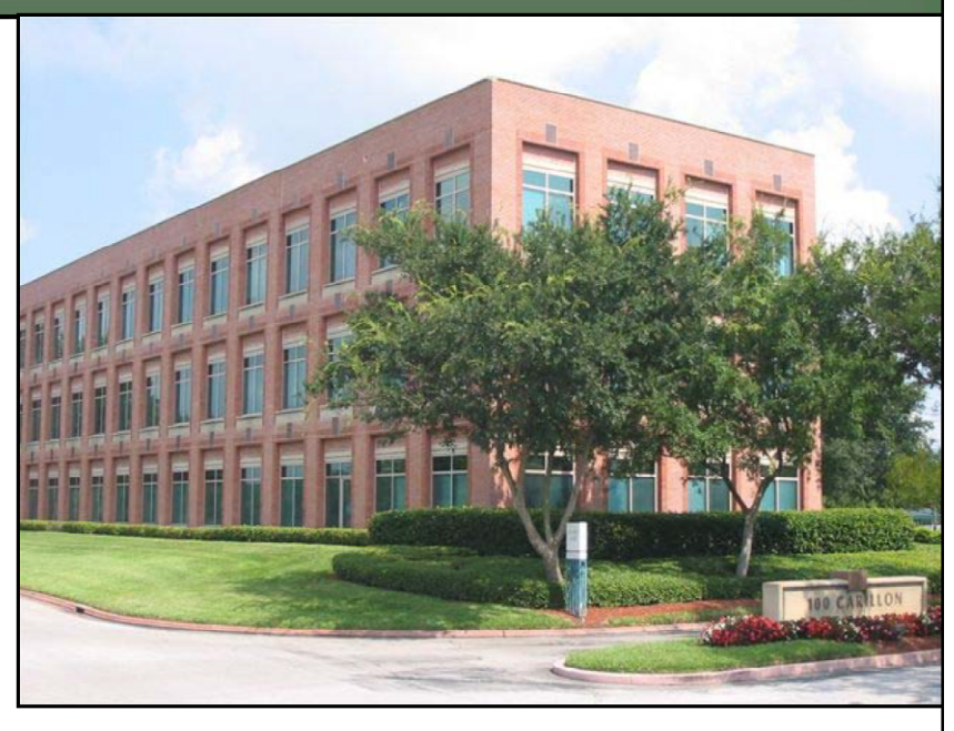
100 Carillon Parkway St. Petersburg, Florida 33716