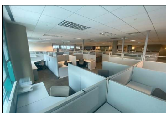
No Additional Charge for: On-site Conference/Training Rooms Cafeteria Fitness Center with Showers/Lockers